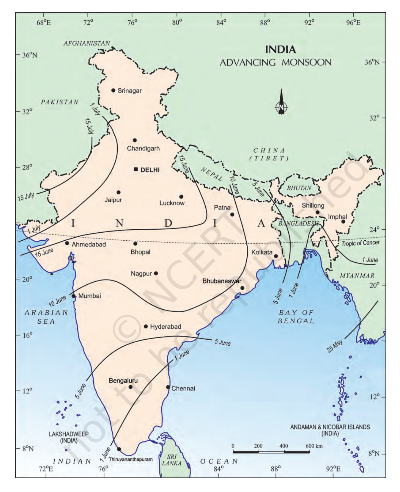
Figure 4.1: Advancing Monsoon