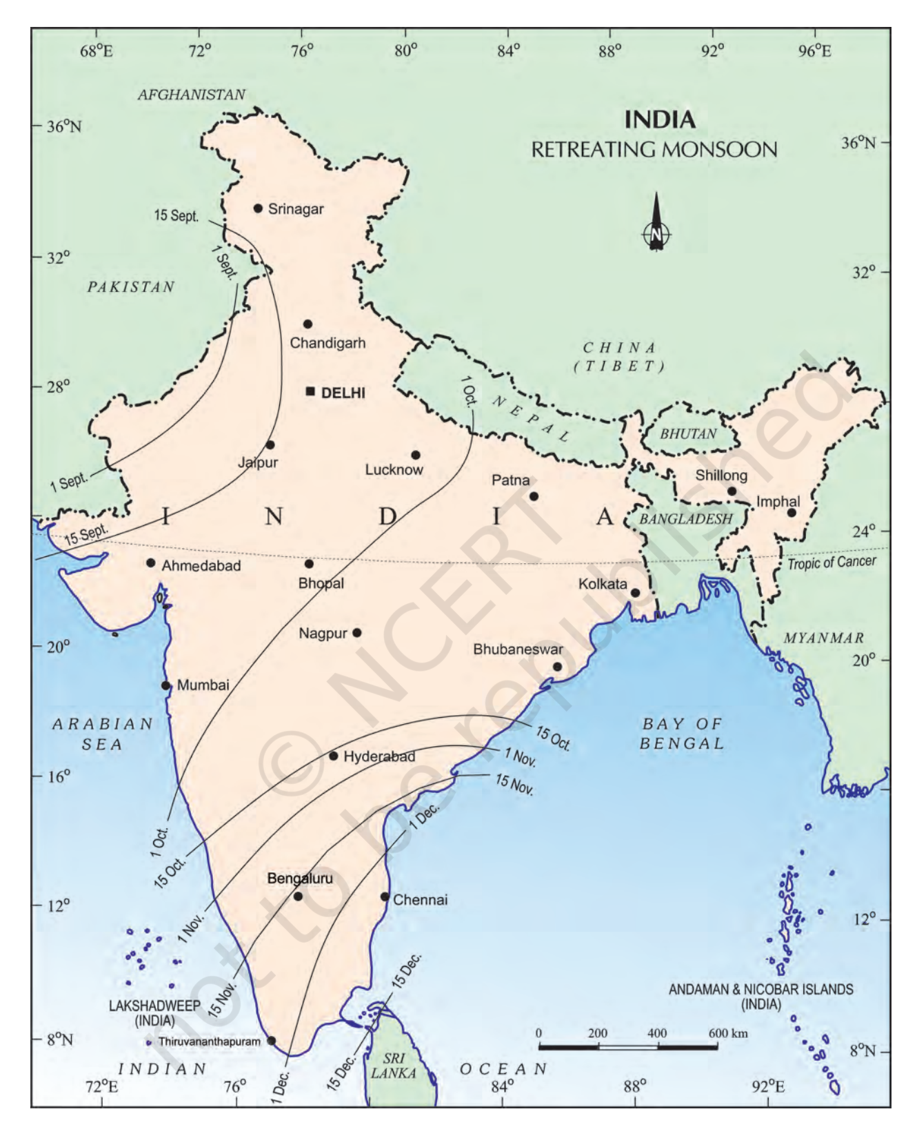
Figure 4.2: Retreating Monsoon